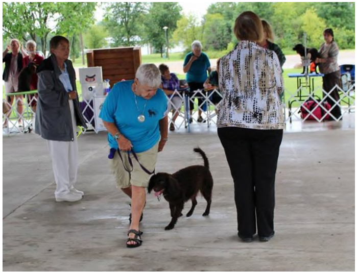
AKC Canine Good Citizen Testing at Nationals